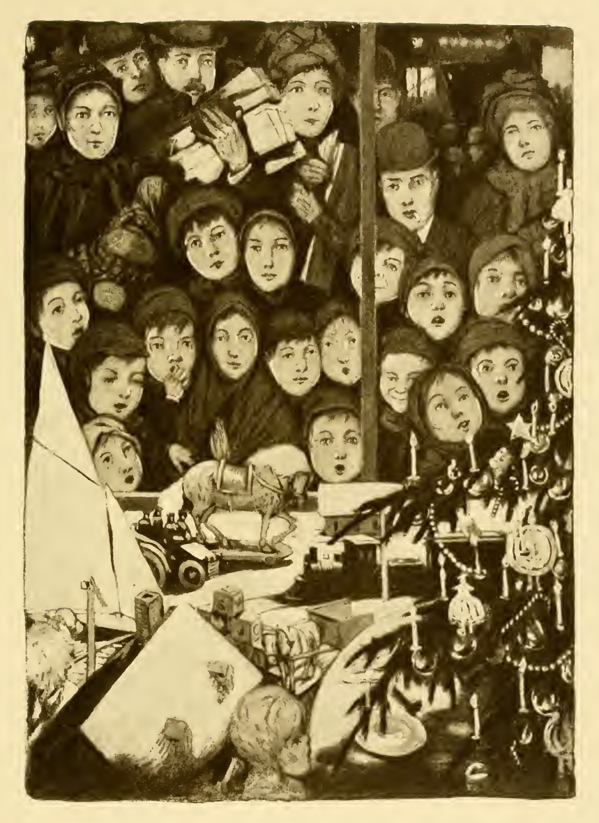
The Window of Toys